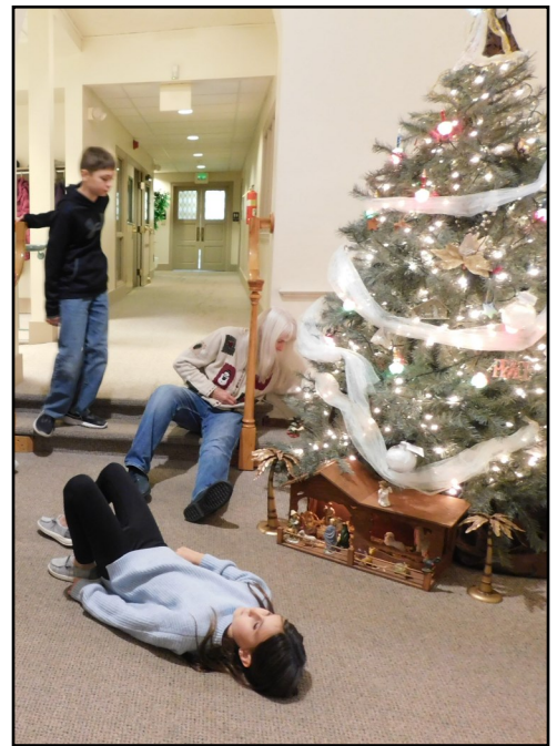
Relaxing after a job well done!